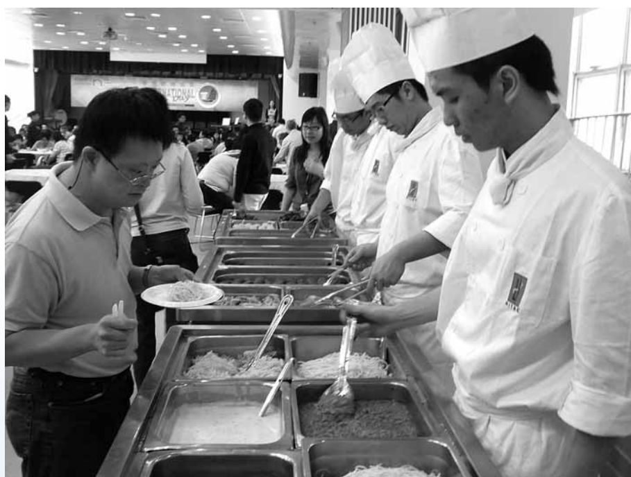
■ International Chefs Day