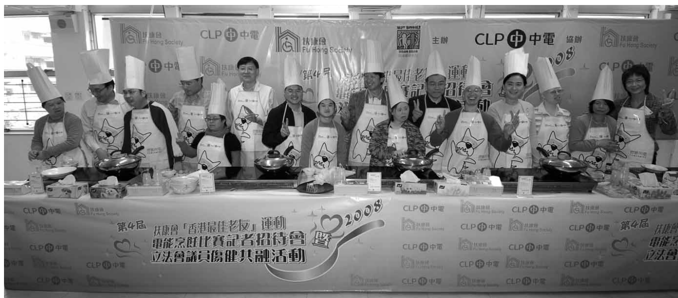
■ Press Conference cum Electric Cooking and Easter Egg Decoration Activity