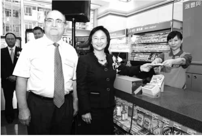
■ 7-Eleven現金捐款計劃啟動禮

此外，我們積極提供更多便利的捐款途徑，方便社區人士捐款。本會於去年參與由滙豐銀行及7-Eleven合作推廣的7-Eleven現金捐款計劃，讓社區人士可於全港任何一間7-Eleven捐款予本會。