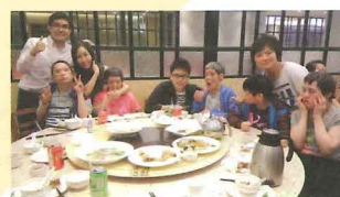
樂華成人訓練中心社區老友與他們的老友出外晚膳。 Buddies of Lok Wah Adult Training Center went for dinner with Community Buddies outside together.

Between August 2017 and February, 2018, our chapters conducted many social inclusive activities. Members could meet their buddies regularly and develop deeper friendship in these activities. Please see their happy and beautiful faces in the snapshots below .