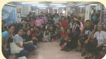
香港賽馬會與毅誠工場分社一同探訪長者中心。 Buddies from The Hong Kong Jockey Club and Ngai Shing Workshop visited an elderly center.