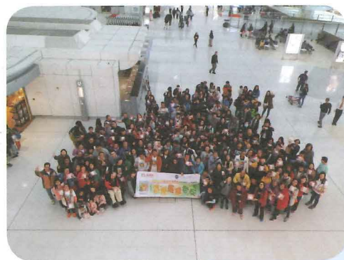
About 360 best buddies joined cup noodles DIY activity. 約 360 名香港最佳老友參與了杯麵製作活動。