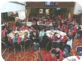
Best Buddies wrote "Fai Chun" together at Fun day. 香港最佳老友於同樂日一起寫揮春。

About 360 best buddies from our 22 chapters joined Fun day in January 2018. They participated the cup noodles DIY session at "Dream Comes True" studio, visited Aviation Center and Skydeck to watch planes lift off and landing. After that, they arrived Lingnan University for luncheon.