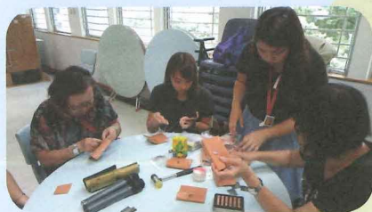
家庭老友一同製作皮革錢包。 Family Buddies joined the leather wallet DIY workshop.