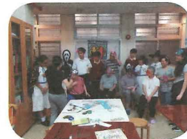
新生命教育協會呂碧碧鳳中學與婉明軒的老友一同參與萬聖節活動。 Buddies of New Life Si Lui Kwok Pi Fong Secondary School and Splendor Casa Famiglia Chapter had fun in Halloween activity.