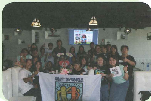
Alumni and Ambassadors of Best Buddies Hong Kong joined ‘Dream the Big Dream’ Workshop in last October.