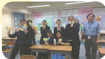
寶覺中學與順利成人訓練中心的老友一起為探訪長者中心，在校內準備小禮品。Buddies from Po Kok Secondary School and Shun Lee Adult Training Center prepared souvenirs for visiting an elderly center with buddies.