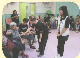
捷和實業有限公司與樂華成人訓練中心分社成員一同探訪長者中心。Buddies from Chiaphua Industries and Lok Wah Adult Training Center Chapter visited an elderly center together.