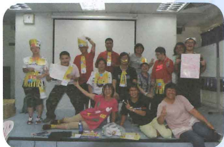
家庭老友在營裏參加了其中一個遊戲，憑無限創意為大家創作一個家庭角色！In the camp, some of the family buddies participated in a creativity game to create a family character

Family Buddies Programme held a day camp last October and about 100 family members from families with and without intellectual disabilities joined for promoting social inclusion and family buddies.