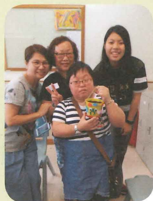
家庭老友一同種植盆栽。 Family Buddies did the planting together.