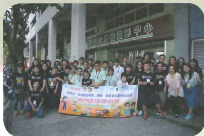
香港最佳老友探訪澳門扶康會。 Best Buddies Hong Kong visited Fuhong Society of Macau.

「香港最佳老友」運動·賽馬會社會共融計劃一行 45 人於 2017 年 9 月 23 及 24 日到澳門交流，到訪了數個團體，包括：澳門最佳老友、澳門扶康會及澳門弱智人士家長協進會。各位老友除探訪了不同的康復團體外，更重要是透過這次交流活動，老友們能一起結伴到境外旅遊，是一個難得的體驗和美好的回憶。