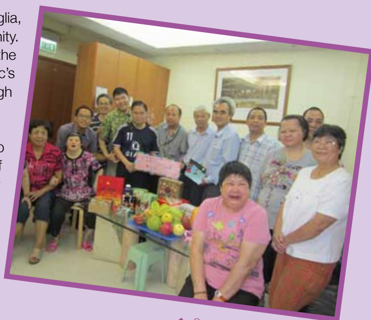
▲ Casa Famiglia Volunteers' Vist

We are in gratitude with The Hong Kong Jockey Club Charities Trust for sponsoring partial recurrent cost of Casa Famiglia. With the implementation of the statutory minimum wage and The Residential Care Homes (Persons with Disabilities) Ordinance, the Society is facing the challenge of the need of additional resources to support the Casa Famiglia. We welcome any support from the community in our work to provide a warm family life to persons with intellectual disabilities.