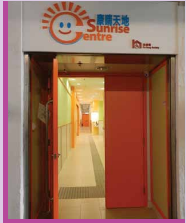
▲ Sunrise Centre

The BBHK movement has gained much support from the community. We are thankful to The Hong Kong Jockey Club Charities Trust for approving a grant of $1.76 million to support the movement for the coming three years. In the past year, with the sponsorship of Equal Opportunities Commission of $47,000 for the BBHK Life Story Project, student / citizen buddies, volunteers and staff members have been able to help persons with intellectual disabilities to produce their own unique life story - making a record on their growth, happiness and tears in life.