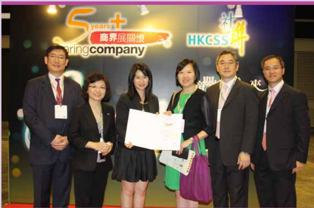
▲ Caring Company NGO Partnership Day

We are grateful that we have good support from many corporations, service users' families, donors as well as counterparts from the Mainland. In the past year, 86 corporations nominated by the Society were awarded "Caring Company" by Hong Kong Council of Social Service, representing an increase of 26 corporations as compared with the previous year. New partners have also been formed with numerous corporations. The first BBHK corporate chapter will soon be formed by Chiaphua Industries Ltd with their participating colleagues matching one-to-one as friends with service users of Lok Wah Adult Training Centre.