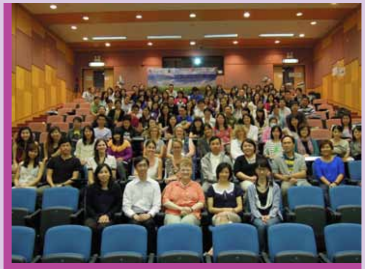
▲ 牽蝶中心訓練課程

我們感謝香港賽馬會慈善信託基金撥款，資助扶康家庭的部分經常開支。隨著最低工資及殘疾人士院舍條例落實執行，本會正面對扶康家庭需要更多資源的挑戰，我們歡迎社會各界的支持，共同為智障人士建立溫馨的家庭生活。