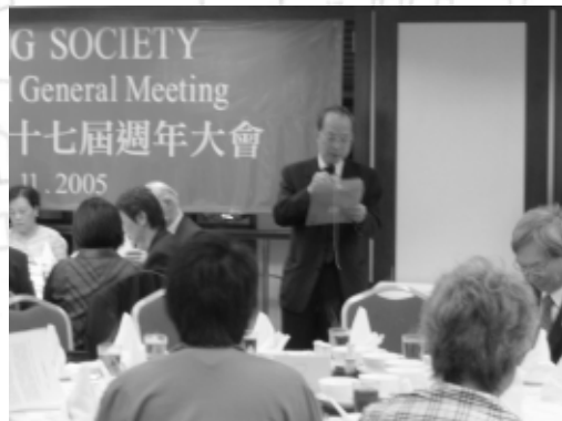
■扶康會第 27 屆週年大會

過去一年，本會繼續推動「香港最佳老友」運動的發展，目前已有七間中學及大專院校成立「香港最佳老友」分社。本會將向特殊學校推廣此運動，以招募更多智障人士參與。為推廣「香港最佳老友」運動，本會於 2006 年 3 月及 4 月舉辦第二屆「香港最佳老友」運動電能烹飪比賽。本會很高興得到中華電力有限公司連續兩年成為協辦團體，並得到梁文韜先生、瑪俐亞女士及謝寧小姐擔任決賽評判。決賽於奧海城舉行，本會感謝歌星李逸朗先生及蔣雅文小姐擔任大會表