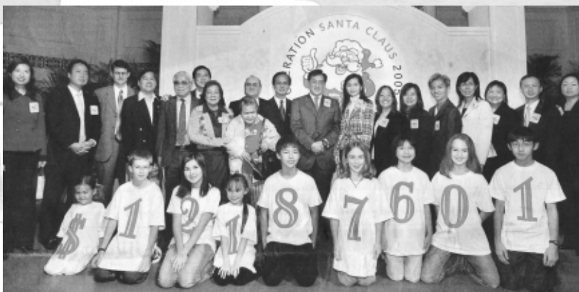
■ "Operation Santa Claus" Closing Ceremony