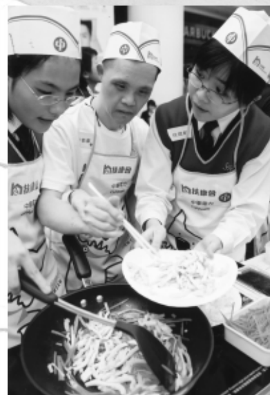
■ 2nd "Best Buddies Hong Kong" Movement Induction Cooking Competition