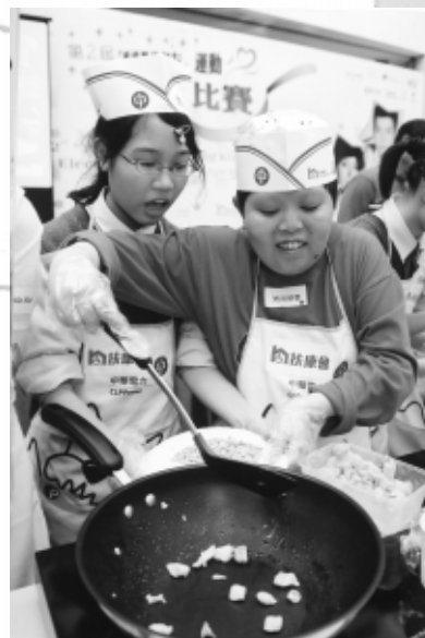
■第二屆「香港最佳老友」運動電能烹飪比賽