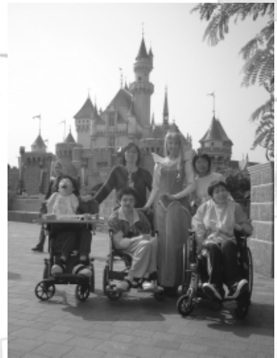
■ Visit to Hong Kong Disneyland

In the past year, we continued our endeavour in promoting the "Best Buddies Hong Kong" Movement. There are currently 7 secondary