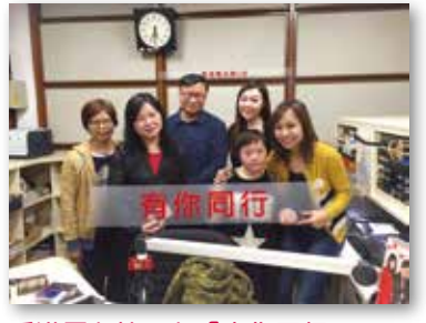
香港電台第五台「有你同行」 RTHK 5 Program