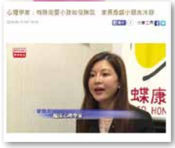
香港電台網上新聞 RTHK Web News