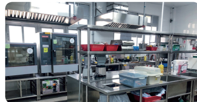
訓練廚房 Training Kitchen