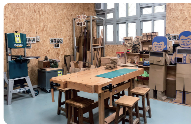
升級再造工房 Upcycling Workshop